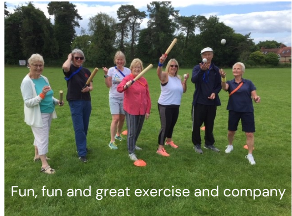
Fun, fun and great exercise and company

We played a game and everyone got into the spirit and ran and laughed.