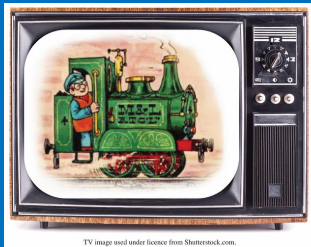
TV image used under licence from Shutterstock.com.